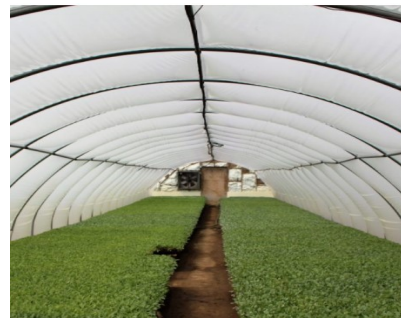
Cabbage Transplants—Hoop House

to extend our growing season. The types of structures used include: greenhouses, high tunnels & hoop houses row covers, low tunnels, caterpillar tunnels, .