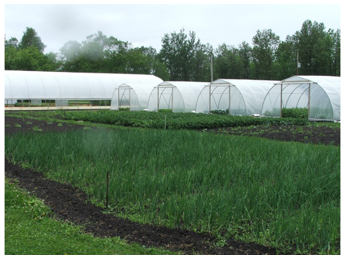
A. G.'s Produce, Emo Ont