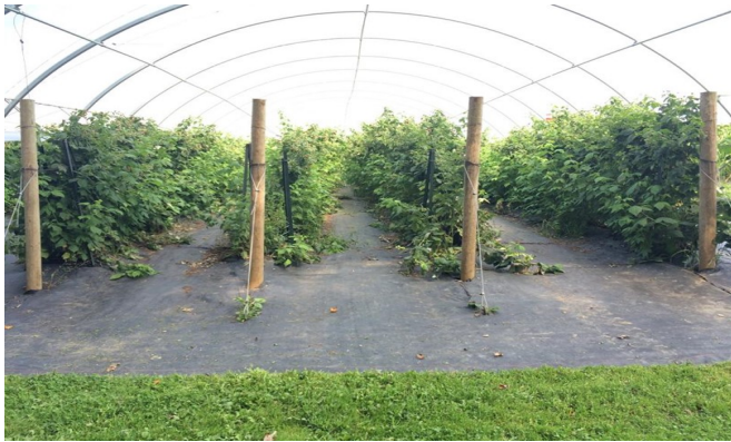
Sheldon Berries High Tunnel - Fall bearing Raspberries

On December 8, 2021, IAPO hosted another of the regular workshops. The High Tunnel and Hoop House Workshop highlight two farms' approach to extending the growing season. Interest in high tunnels and hoop houses continues to grow across the province. This topic is timely in light of food security concerns. The more remote areas of the province and those where ordinary cropping practices are limited by climate have shown great interest in exploring these production options.